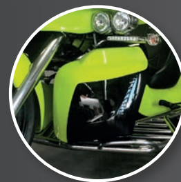
Leg cover (removable without tools)