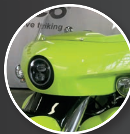
Cockpit cover with windshield