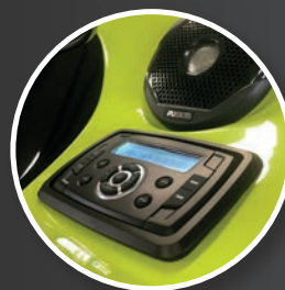
Sound & Navigation preparation