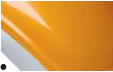
● Melon-Yellow (GRP*-colour)