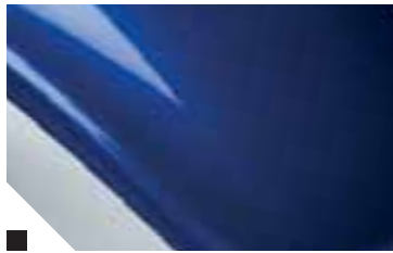
■ Racing-Blue pearl effect (Varnish)