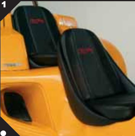
1 Side support Sport seats with anatomical fit