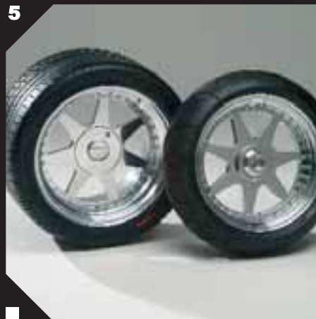
5 High Performance Wheels rear 285/35 ZR 18 or 335/30 ZR 18 and front wheel 200/50 ZR 17