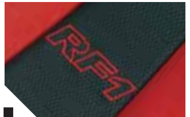
■ Black / Red

For printing reasons the bodywork and upholstery colours shown here may vary slightly from the actual colours used.