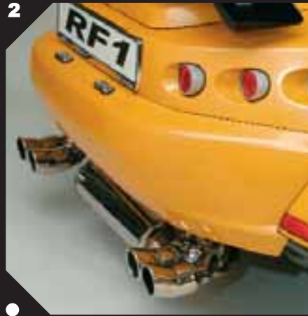
2 Dynamics Stainless steel sport exhaust and air filter deliver an acoustic experience