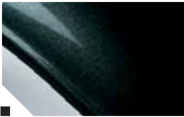
■ Panther-Black pearl effect (Varnish)