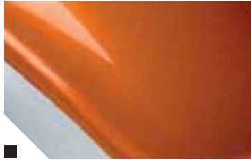
■ Electric-Orange pearl effect (Varnish)