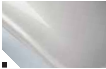
■ Brilliant-White pearl effect (Varnish)