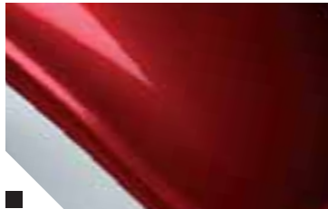
■ Ruby-Red pearl effect (Varnish)