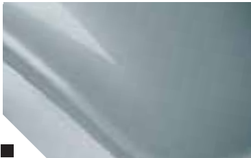
■ Reflex-Silver pearl effect (Varnish)