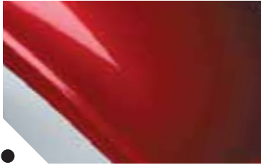
● Ruby-Red (GRP*-colour)