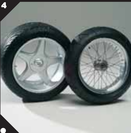
4 Grip Wheels rear aluminium rim 275/40 ZR 17 and front aluminium spoke wheel 180/55 ZR 17