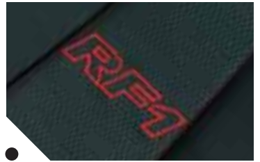
● Black / Black