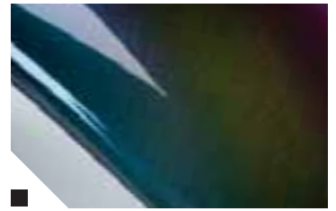
■ Chameleon colour (Effect varnish)