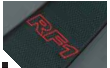
■ Black / Grey