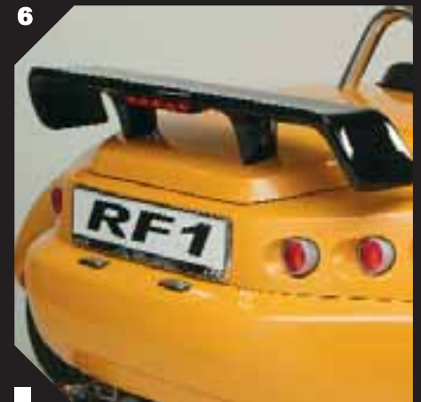
6 Individuality The rear spoiler offers a compact and sporty note