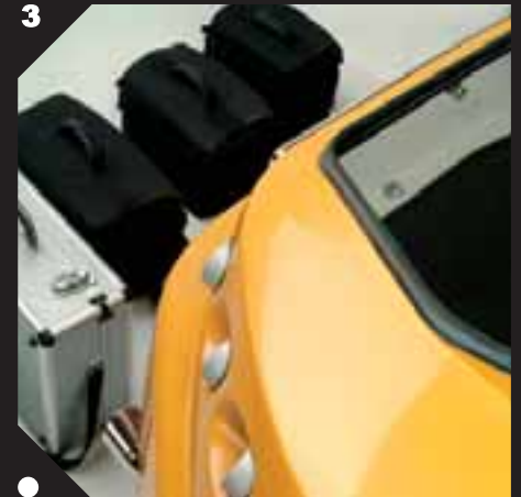
3 Generous space Boot with more than 200 ltr. capacity and practical glove compartment